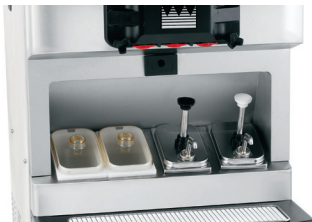
Integrated Syrup Rail Option - 2 room temperature with lids & ladles, 2 heated with syrup pumps