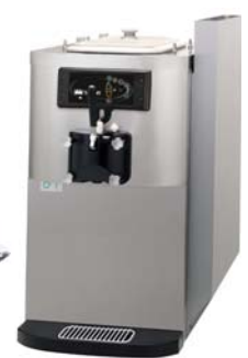
Optional Top Air Discharge Chute